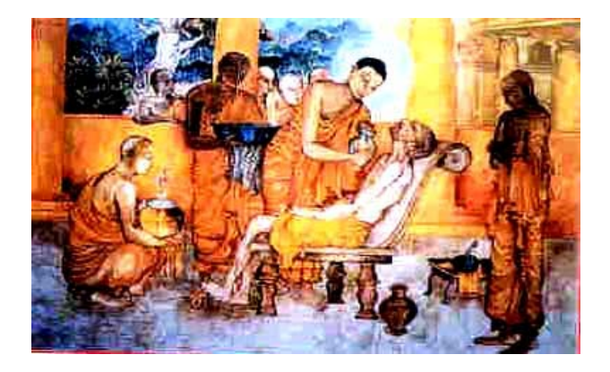
The Buddha nursing a sick Bhikkhu

In the Buddhist scriptures the Buddha is also called as Bhaisajya-Guru and Mahabhisak i.e., great physician. The VI <sup>th</sup> Book of the Mahavagga, called Bhaisajya-Skandhaka, gives valuable information about a number of common diseases and their treatment. Diagnosis of disease and charitable distribution of medicines was the regular programme of the Buddhist Sanghas and was implemented by the monks in the monasteries.