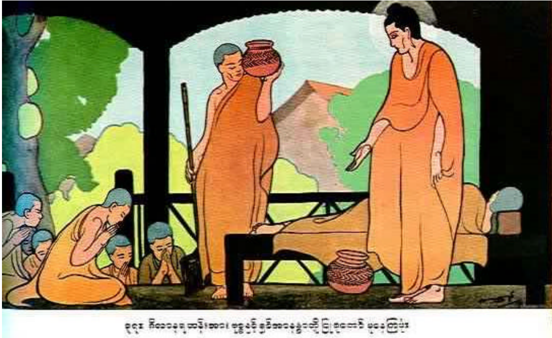
Ven. Ananda Ministering the sick Monk

Introduction – Reading the story of Ven. Ananda Thera , we come to know the significance of paying homage to Bodhi tree . It was instructed by Buddha to plant a sapling Bodhi tree to represent him – Buddha said to Ananda –