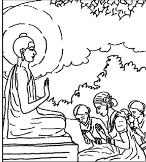
Foster mother Mahapajapati Gotami asking Permission for admission to Bhikkhuni Order