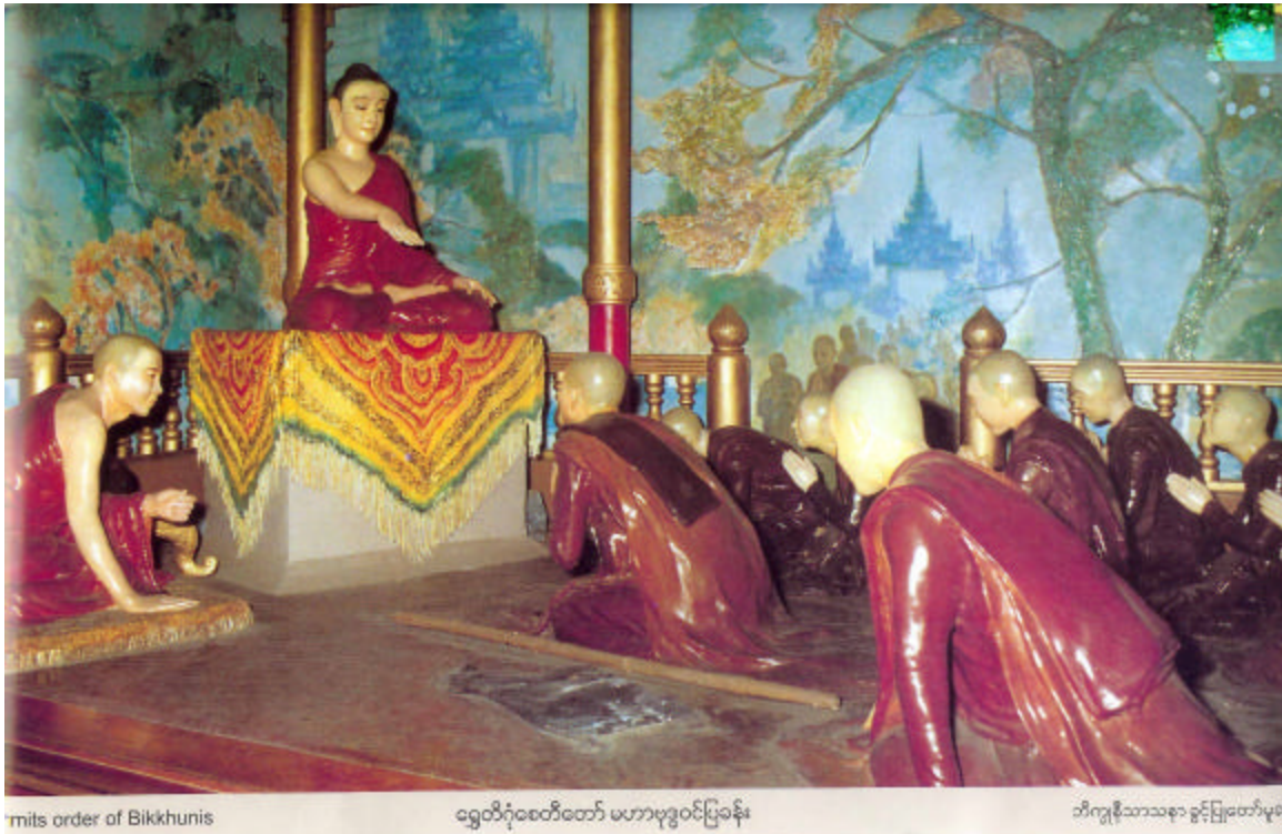
Buddha admitted Mahapajapati Gotami to Bhikkhuni Order

The Buddha was dwelling at Kapilavatthu in Banyan Park Monastery. Maha-pajapati Gotami approached the Buddha along with five hundred women of the Sakya clan, and begged permission for women to be admitted into the Order as Nuns. The Buddha refused permission saying, 'Enough, O Gotami, do not ask that women be admitted into the Order as Nuns'. She went away sorrowful and sad.